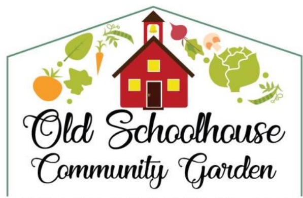
An Outreach Ministry of Immanuel Lutheran Church-Hillside

Please pray for continued guidance and support of our expansion project!